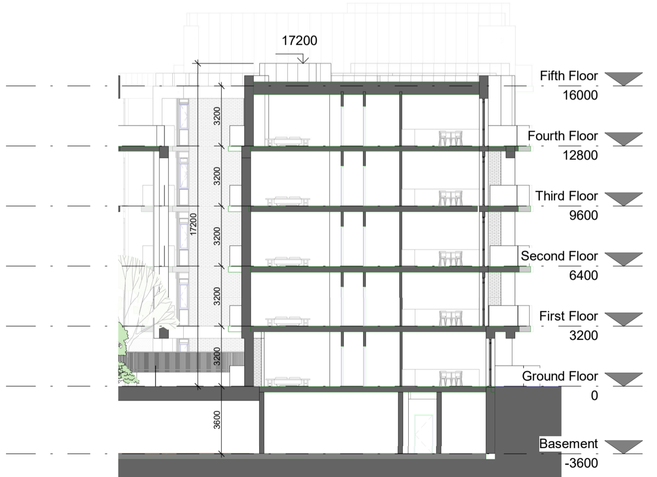
Block 6 Section A-A