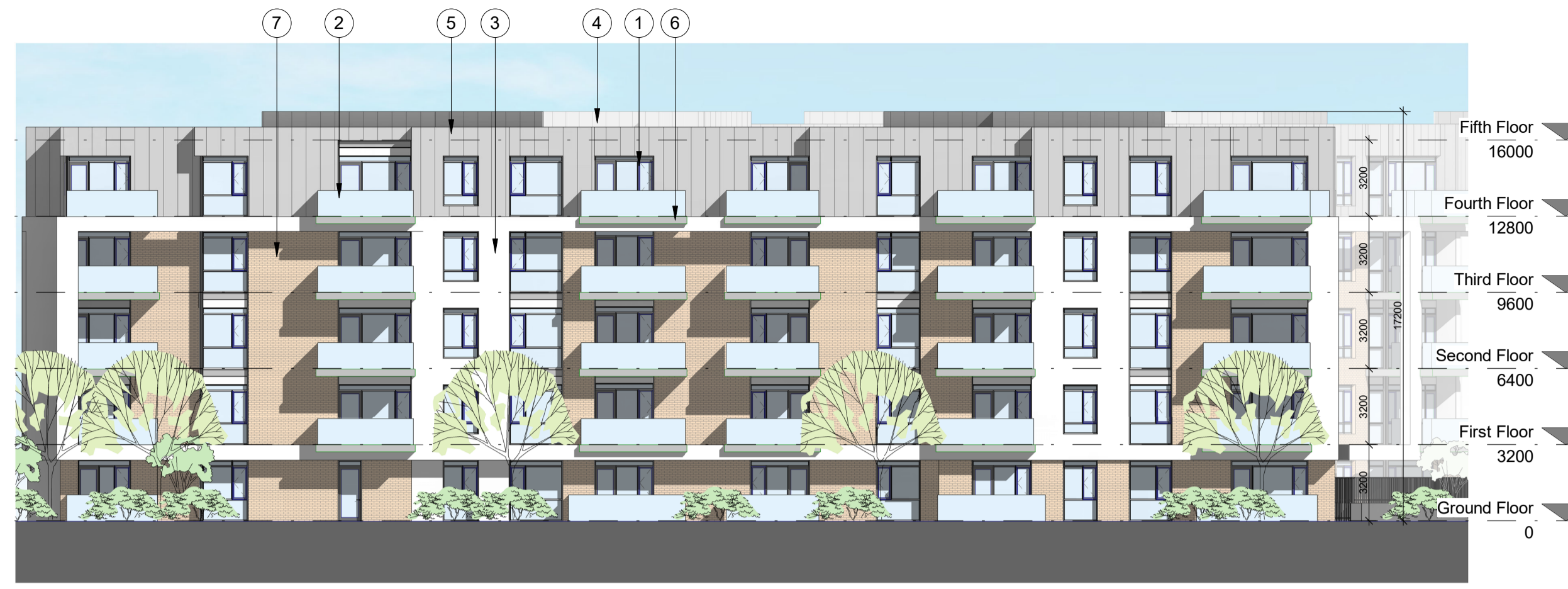
Block 6 South Elevation